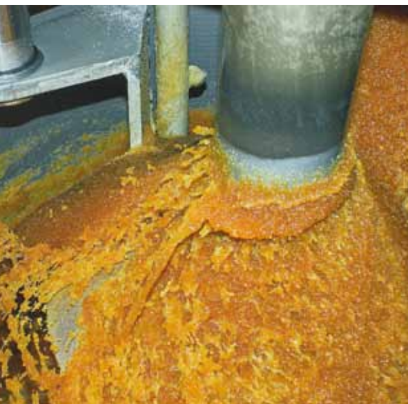
View of the inside