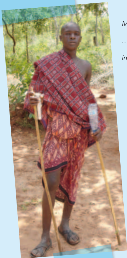
Meeting people ... while travelling in Tanzania