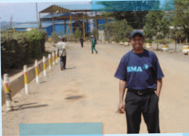
... in Kenya