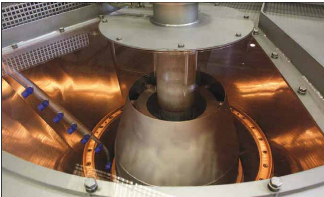
Figure 2. Two-stage basket of the K3300

achieving considerably increased throughput values compared to conventional executions.