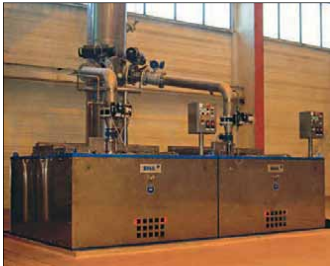
Figure 1. Station with two K3300 centrifugals in the beet sugar factory, Sucrerie de Toury

The key component of this new basket is the pre- separation stage, which is located in the lower part of the basket (Figure 2) and equipped with a wear-resistant wedge-wirescreen liner. In the pre-separation stage, a large part of the syrup is already separated. Moreover, the entire basket shell is equipped with an optimal number of special, patented outlet openings, which ensure quick syrup discharge from the basket. In this way, the energy efficiency is increased to an optimum value, since the syrup need not be accelerated unnecessarily. This new basket with pre-separation stage and special outlet openings thus allows